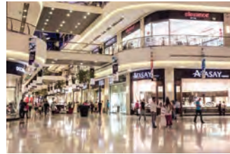
▶ Shopping malls 30