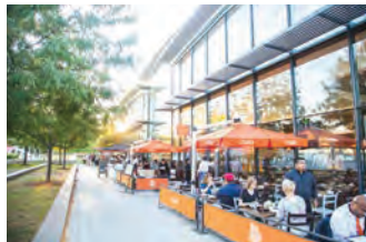
▶ Restaurants 58