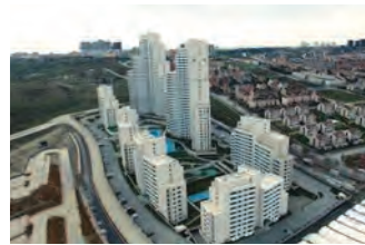
▶ Housing Projects 214