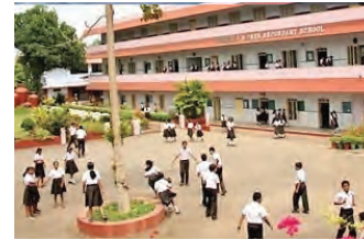
▶ Educational institutions 722