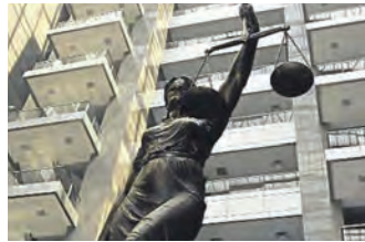
▶ Justice Facilities 18