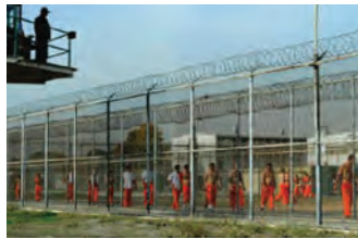
▶ Prisons 5