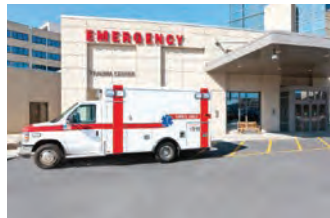
▶ Health Facilities 210