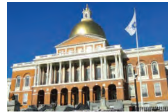
▶ Government Agencies 490