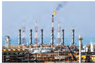
▶ Industrial Facilities 532