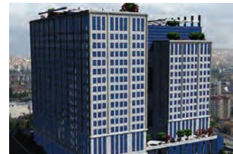
▶ Other Facilities 60