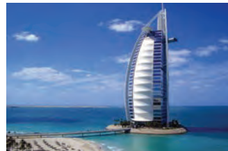
▶ Leisure and Tourism Facilities 639