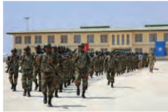
▶ Military Institutions 51